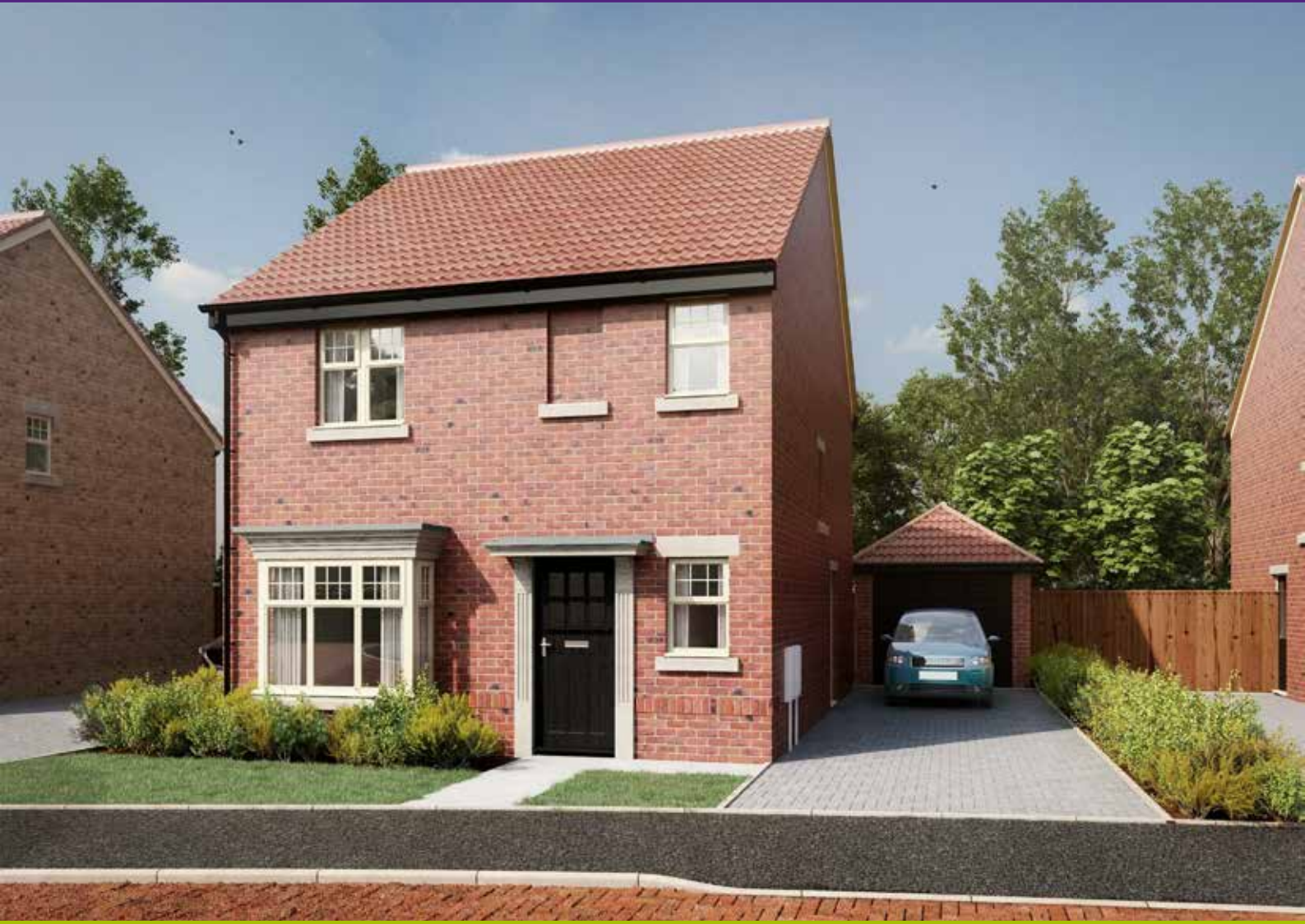
The Tawny, (Plot 4), Pavilion Gardens, North Cave, East Yorks., HU15 2NW